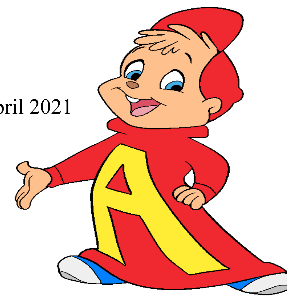
Fig 2. Alvin's appearance in the 1980s "Alvin Seville" DisneyFandom https://disneyfanon.fandom.com/wiki/Alvin_Seville PNG file 6 April 2021