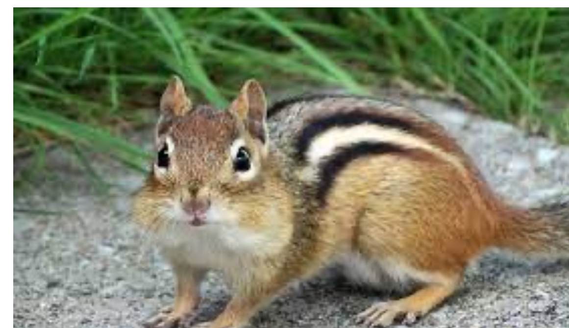
Fig 4. Image of a wild chipmunk "Chipmunks in the Garden" Extension https://extension.unh.edu/blog/chipmunks-garden JPEG File 6 April 2021