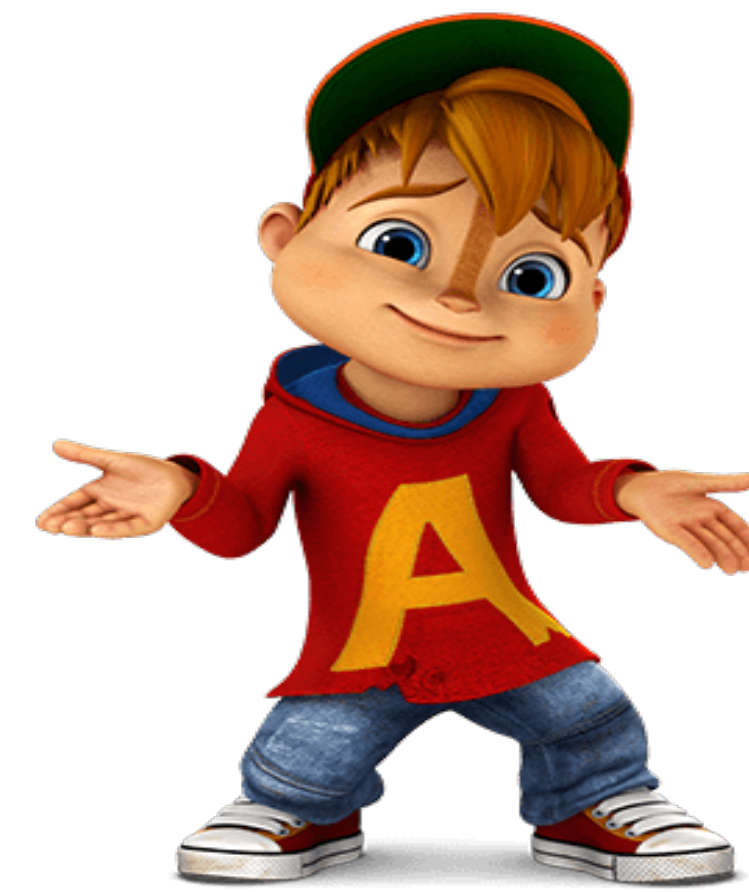
Fig 1. Alvin's appearance in 2015 show "Alvin" Parody Fandom https://parody.fandom.com/wiki/Alvin_Seville#Portrayals : PNG file 6 April 2021