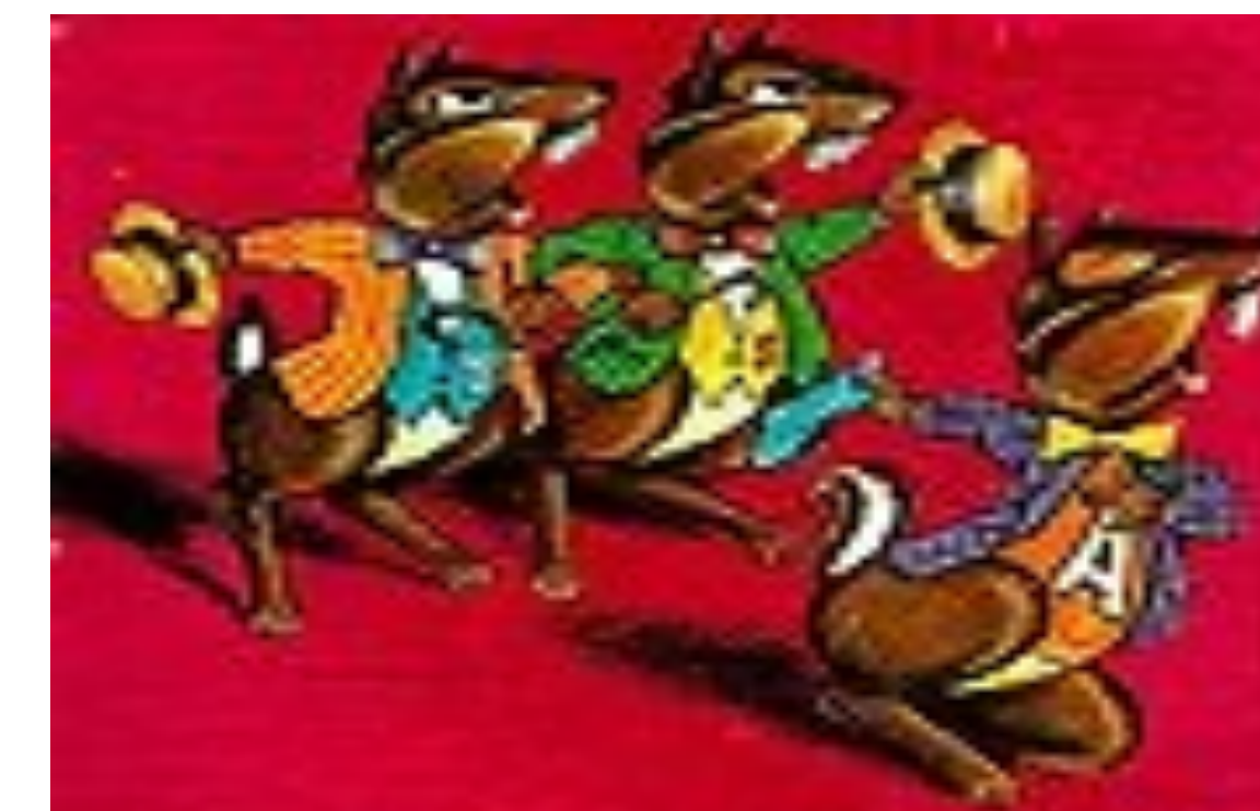
Fig 3. Alvin's design from 1958-1960 "Original Album Cover" Wikifur https://en.wikifur.com/wiki/AlvinandtheChipmunks JPG File 6 April 2021